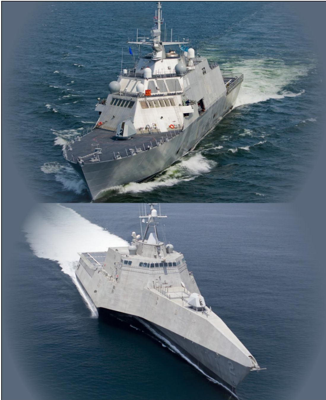
Figure I. Lockheed Baseline LCS Design (Top) and General Dynamics Baseline LCS Design (Bottom)