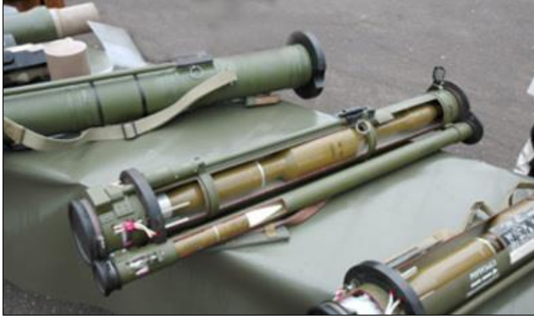
Figure 1. Russian RPG-30