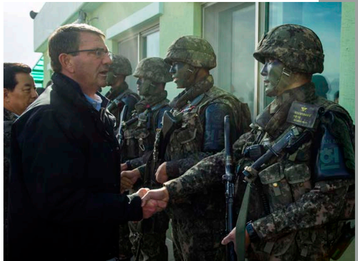
Secretary Carter shakes hands with Republic of Korea Army Soldiers during a visit to The Korean Demilitarized Zone.

North Korea’s nuclear test on January 6th and its ballistic missile launch on February 7th were highly provocative acts that undermine peace and stability on the Korean Peninsula and in the region. The