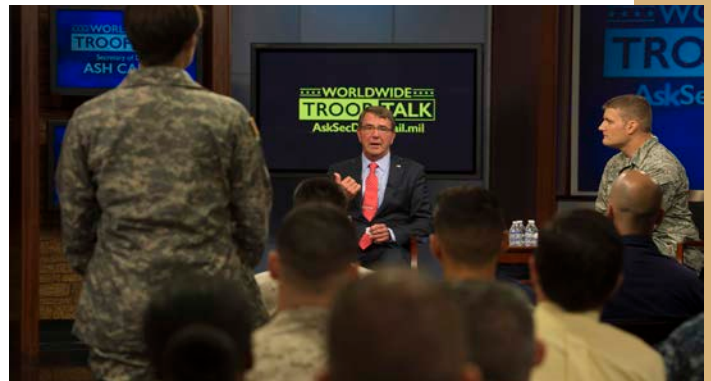
A servicemember poses a question to Secretary Carter during the first Worldwide Troop Talk.

It's important to note that of all the cuts we've taken to our previously-planned budgets since the Budget Control Act was passed, including cuts from sequestration—altogether so far totaling at least $800 billion over ten years—less than 9 percent of those reductions came from military compensation proposals. This should make clear that we've worked extremely hard to protect our people, and that we do need to address some places where savings can be found, such as through modernizing and simplifying our military healthcare system.