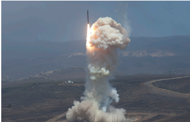
A long-range ground-based interceptor is launched from Vandenberg Air Force Base, California, and intercepted an intermediate-range ballistic missile target launched from the U.S. Army's Reagan Test Site on Kwajalein Atoll on June 22, 2014.

Notably, unlike when the Chinese destroyed a satellite and created thousands of pieces of debris, the United States intercepted the satellite at an altitude sufficient to ensure the intercept did not create long-term space debris.