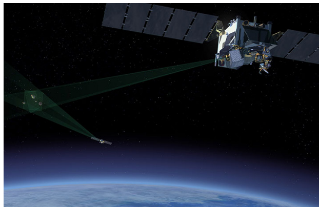
Artist's illustration of STSS-D tracking objects in space.

Efforts to exploit U.S. vulnerabilities are most evident in the area of space. The United States is heavily reliant on space systems, and the ability to access space and protect its satellites from attack is non-optional. Military operations, military force projection, intelligence collection, weather forecasting, daily communication, banking systems, and financial markets all share a critical link—they depend on assets located in space.