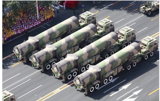
Chinese CSS-10 ICBM Road-Mobile Launchers.

The Rocket Force operates China's land-based nuclear and conventional missiles. It is forming additional missile units, upgrading missile systems, and is developing