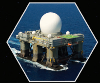
SEA-BASED X-BAND RADAR