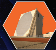
UPGRADED EARLY WARNING RADAR